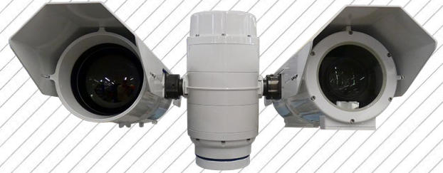
Above: Osiris Ranger EVO2 HD 25-225mm. Other models will vary.